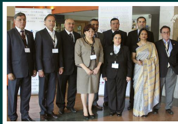
Key government figures from the Eastern European Central Asian region gathered at the conference for meetings with donors from UNODC and UNAIDS.

'This year we were able to expand our services to make them truly worthy of a harm reduction event.'